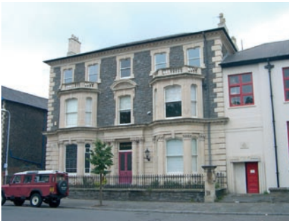
The Old Convent The Walk Cardiff CF24 3AG